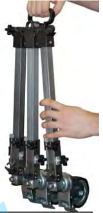
Dolly - Collapsed

The VZD50 is designed for use specifically with the VZ-T75 & VZ-TK75A and the VZ-T100A, but can be used with many different brands of tripods due to the unique mounting style.