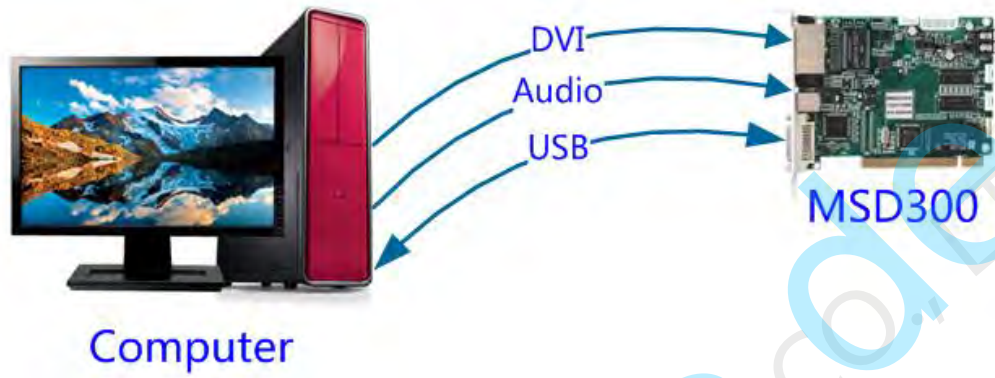
Fig. 2 MSD300 Connection diagram