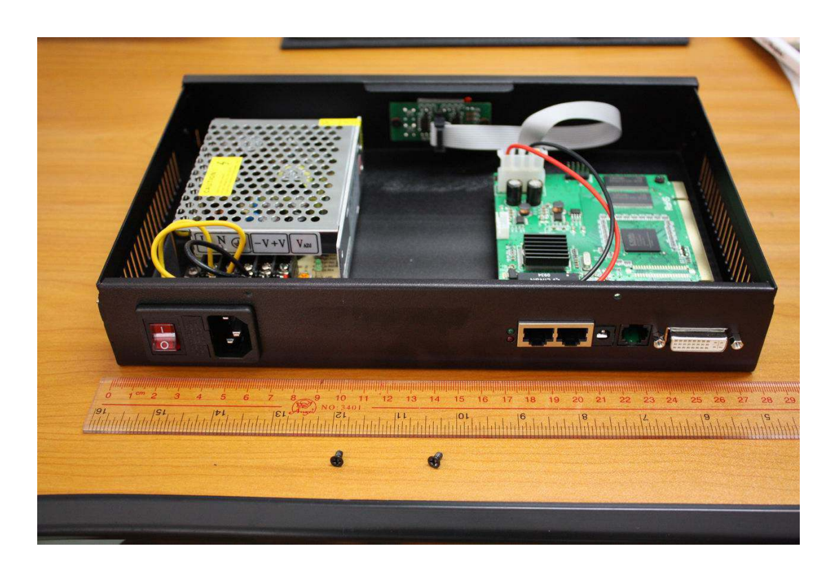
16 grades brightness manually adjust in the front penal.