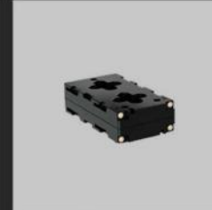
Battery Plate Adapter