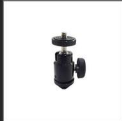
Hot Shoe Mount