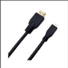
0.8M HDMI A-D Cable