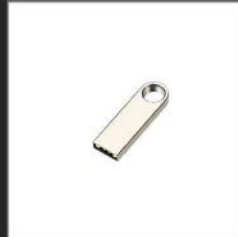
USB Drive Disk