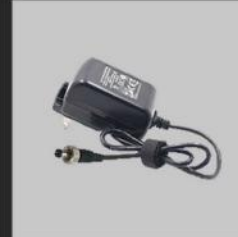
12V 2A DC Power Adapter