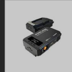
Wireless Video Transmission