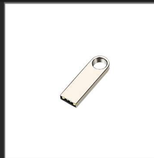
USB Drive Disk