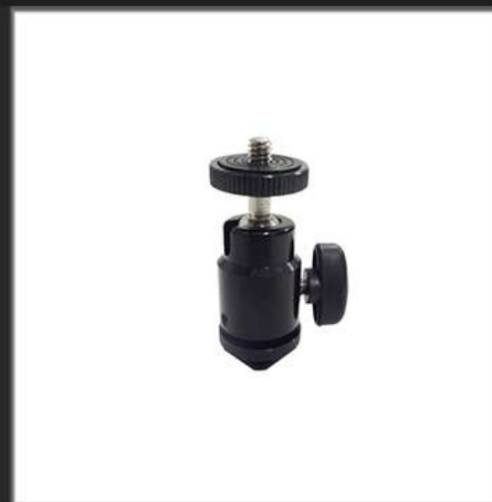
Hot Shoe Mount