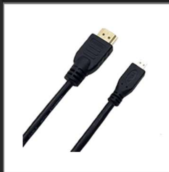
0.8M HDMI A-D Cable