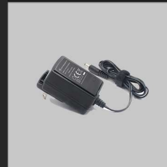
12V 2A DC Power Adapter